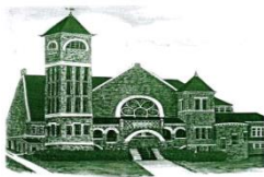
First Presbyterian Church 22 Church Street Gouverneur, New York 13642