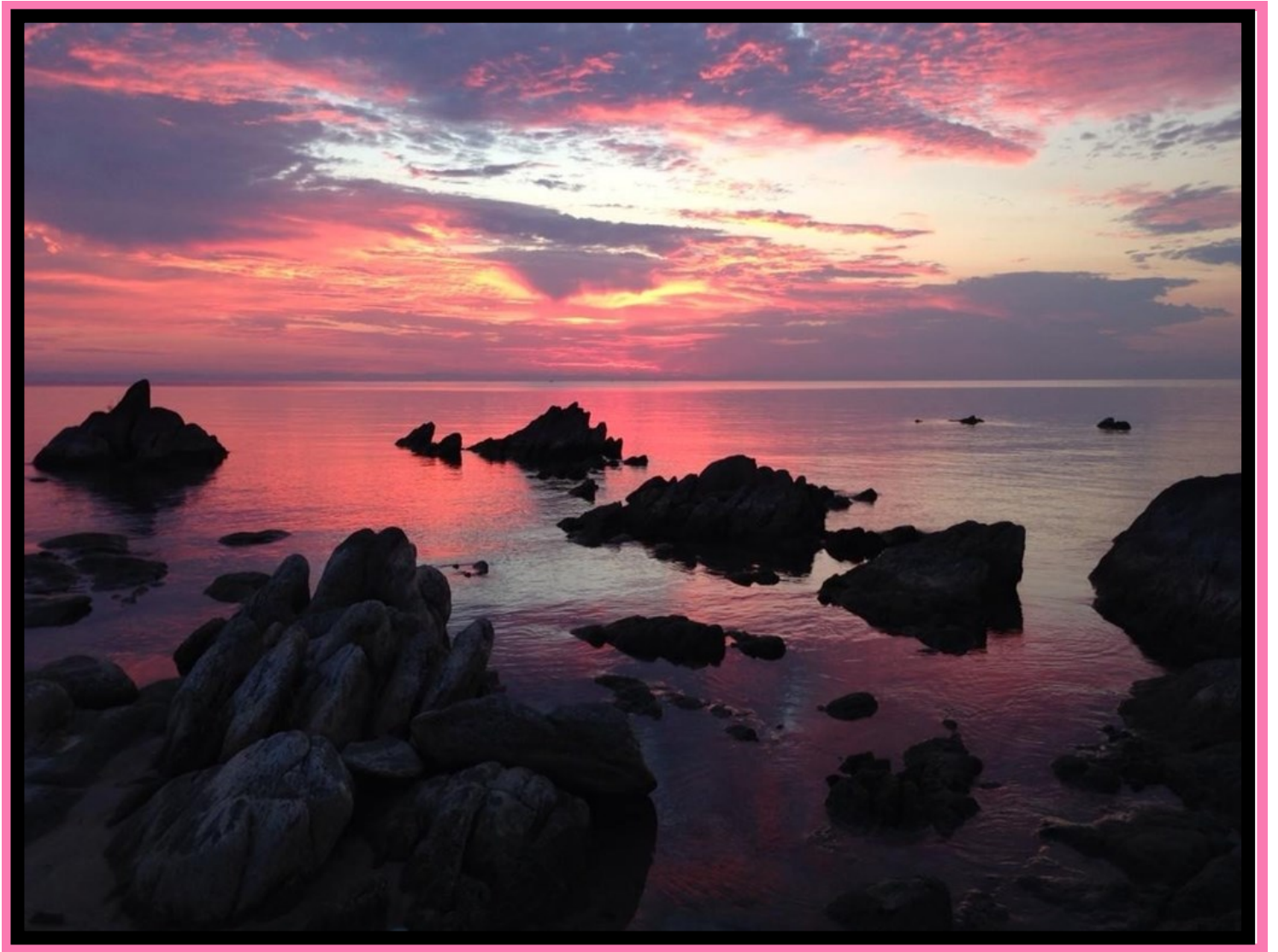
Lake Malawi at Sunrise

How does God's love abide in anyone who has the world's goods and yet refuses help?